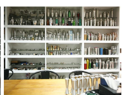
Офис Sample Room 1 Sample Room 2