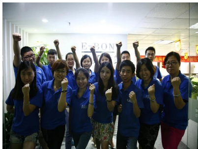
Sample Room 1