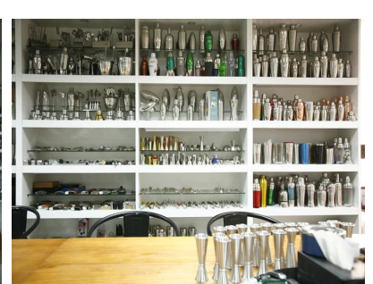
Escritório Sample Room 1 Sample Room 2