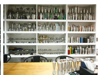
Office Sample Room 1 Sample Room 2