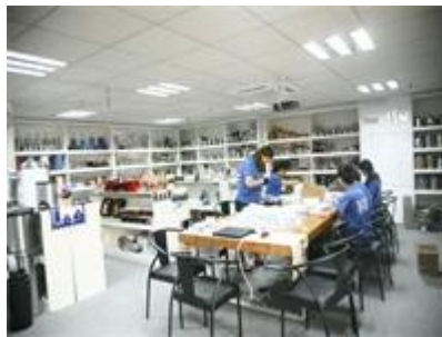
Sample Room 1