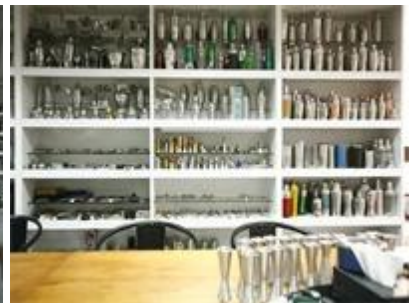
Sample Room 2