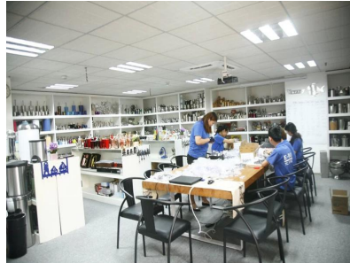
Sample Room 1