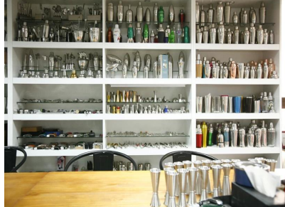
Sample Room 2