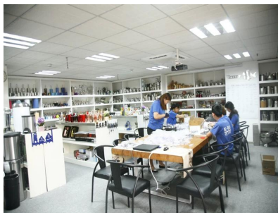
Champion room 1