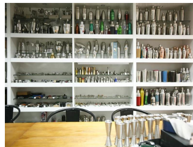
Samples room 2