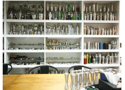
Sample Room 2