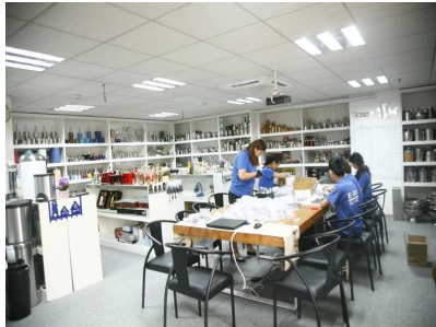
Sample Room 1