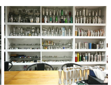
Kantoor Sample Room 1 Sample Room 2