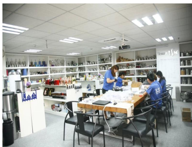
Sample Room 1