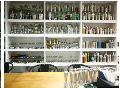
Sample Room 2