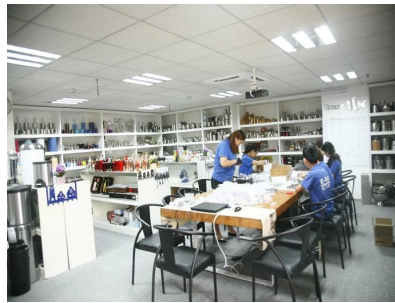
Sample Room 1