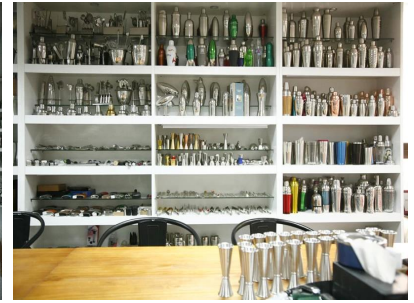
Samples room 2