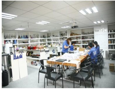
Champion room 1