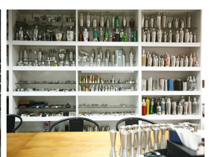
Γραφείο Sample Room 1 Sample Room 2