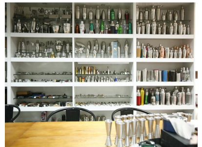
Sample Room 2