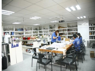
Sample Room 1